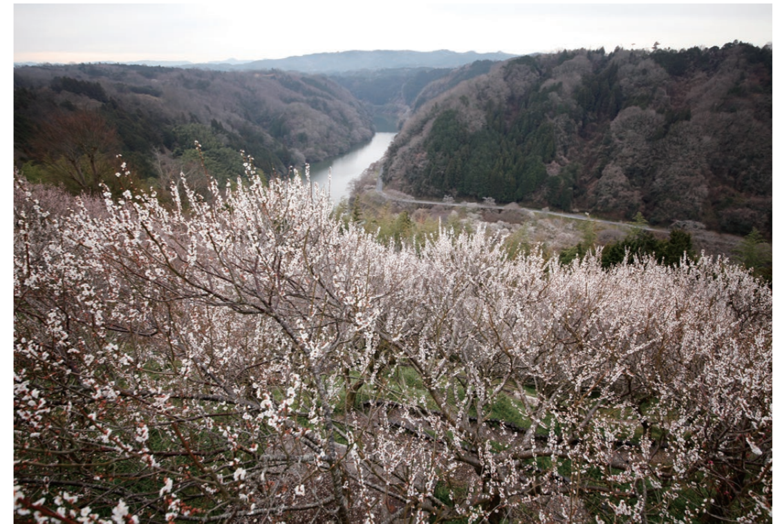
Tsukigase, a Famous Plum Blossom Viewing Spot